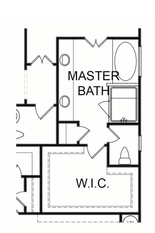
OPT. MASTER BATH LAYOUT